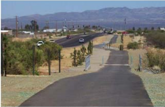
ADD E and City of Sierra Vista- SR 90 Projects (Ayresda Del Sol and Cochise Crossroads)