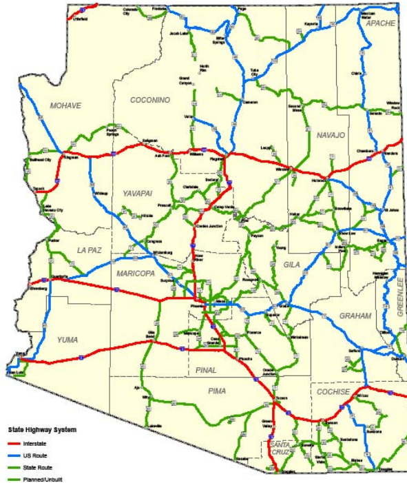
State Highway System

— Interstate — US Route — State Route — Planned/Unbuilt