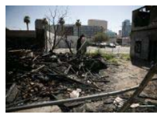
Phoenix Interrupted in Photos